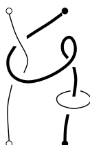
Figure 1: Diagram of a two colored tangle